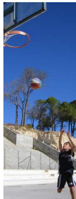
ECP Clubs and Participants